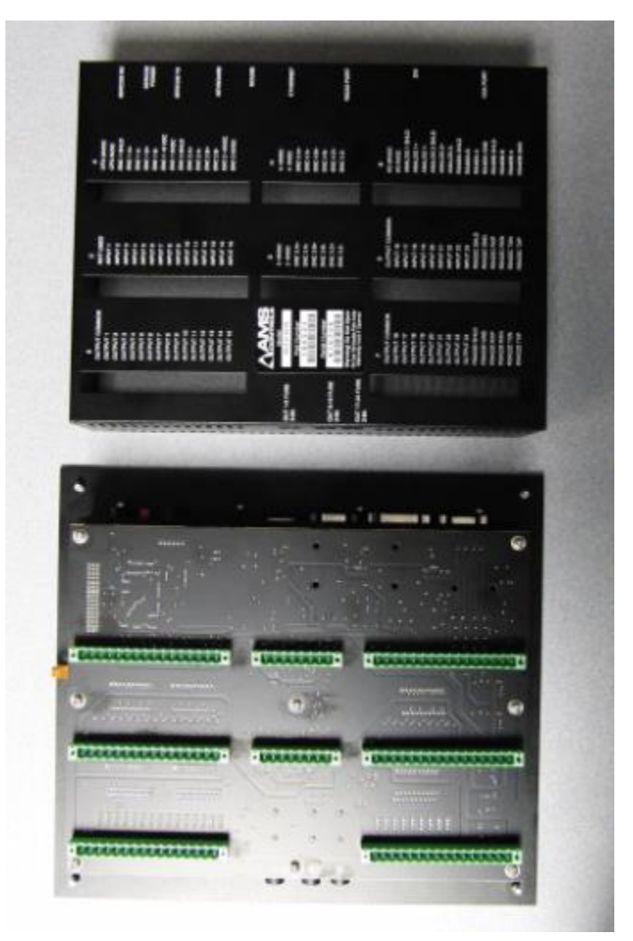
Figure 5 - Back cover and XL200 with back cover removed

4. Remove the back cover as shown in Figure 5.