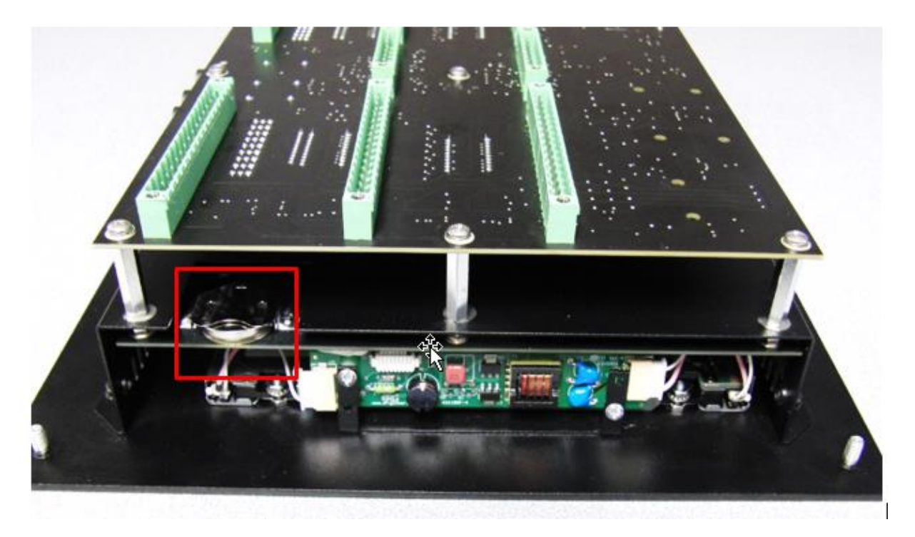
Figure 6 - Right side of XL200

5. Locate the Panasonic CR2450 battery on the right side of the controller as shown in Figure 6.