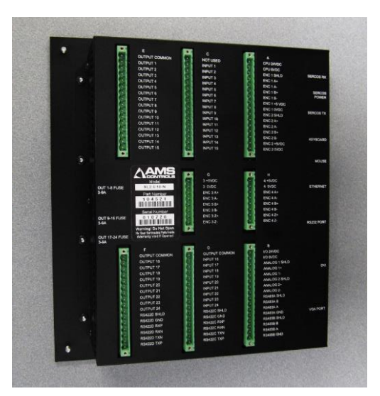
Figure 2 - Back of XL200

1. Flip the controller so that it is face down.