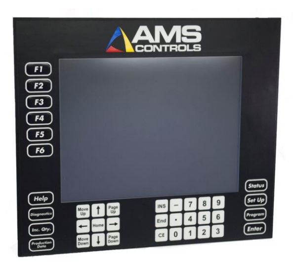
Figure 1 - Front of XL200

WARNING: BEFORE REPLACING THE BATTERY, YOU MUST BACK UP ALL PARAMETERS. LOSS OF POWER TO THE XL200 CONTROLLER WILL CLEAR ALL PARAMETERS.