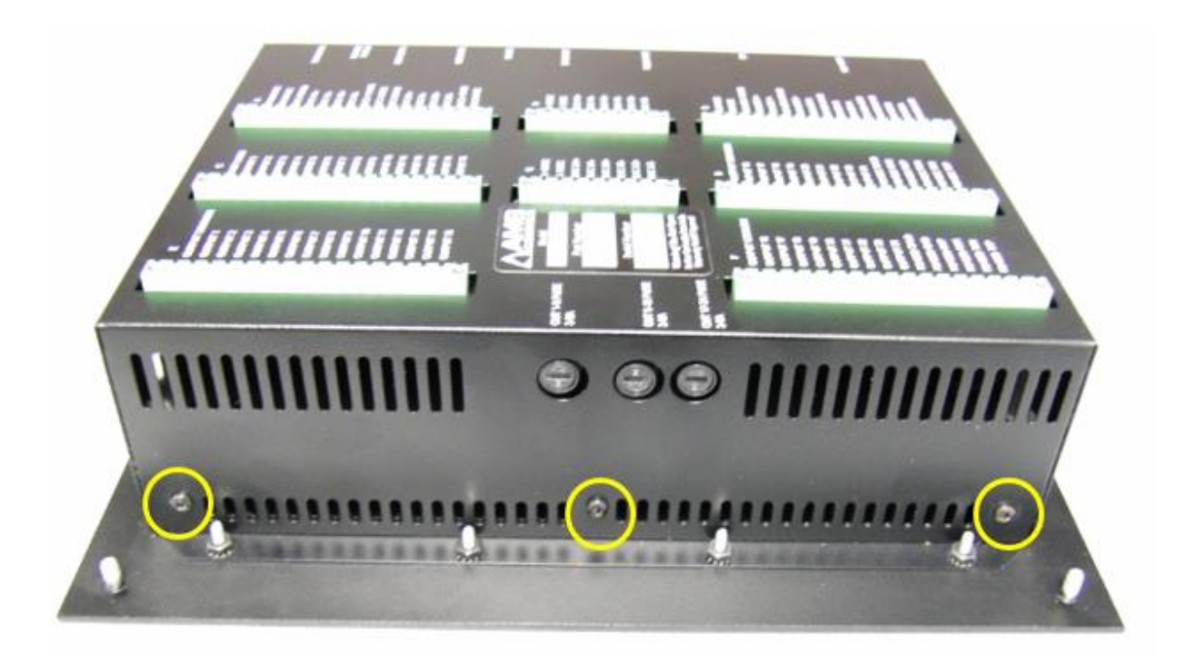
Figure 3 - Bottom of XL200

2. Remove the 3 screws on the bottom of the controller circled in yellow in Figure 3.